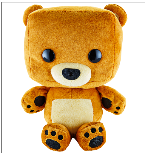
Figure 2: Fisher-Price Smart Toy Bear

The Fisher-Price Smart Toy bear is a Wi-Fi-connected stuffed animal marketed as “an interactive learning friend that talks, listens, and ‘remembers’ what your child says and even responds when spoken to.” 47 The Smart Toy bear app and web services collect a range of consumer information, including: parent email address and login password; child’s first name, birthdate, and gender; toy name and identifier; Wi-Fi password; and mobile device information. The bear itself also gathers information, including images and audio that are stored locally on the toy. 48